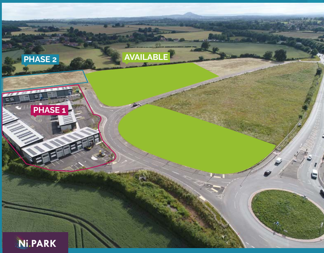
NEW INDICATIVE SITE LAYOUT HIGHLIGHTING PHASE 1

OUR VISION IS TO CREATE THE WORLD'S LEADING AGRI-TECH RESEARCH AND INNOVATION HUB, PUTTING THE UK AT THE FOREFRONT OF HIGH EFFICIENCY AGRICULTURE.